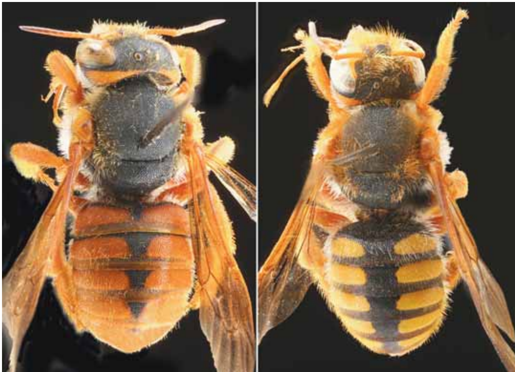
Figure 1. Female of Rhodanthidium sticticum from Tunisia in cMS (left) and R. ordonezi from Morocco in OLL (right).