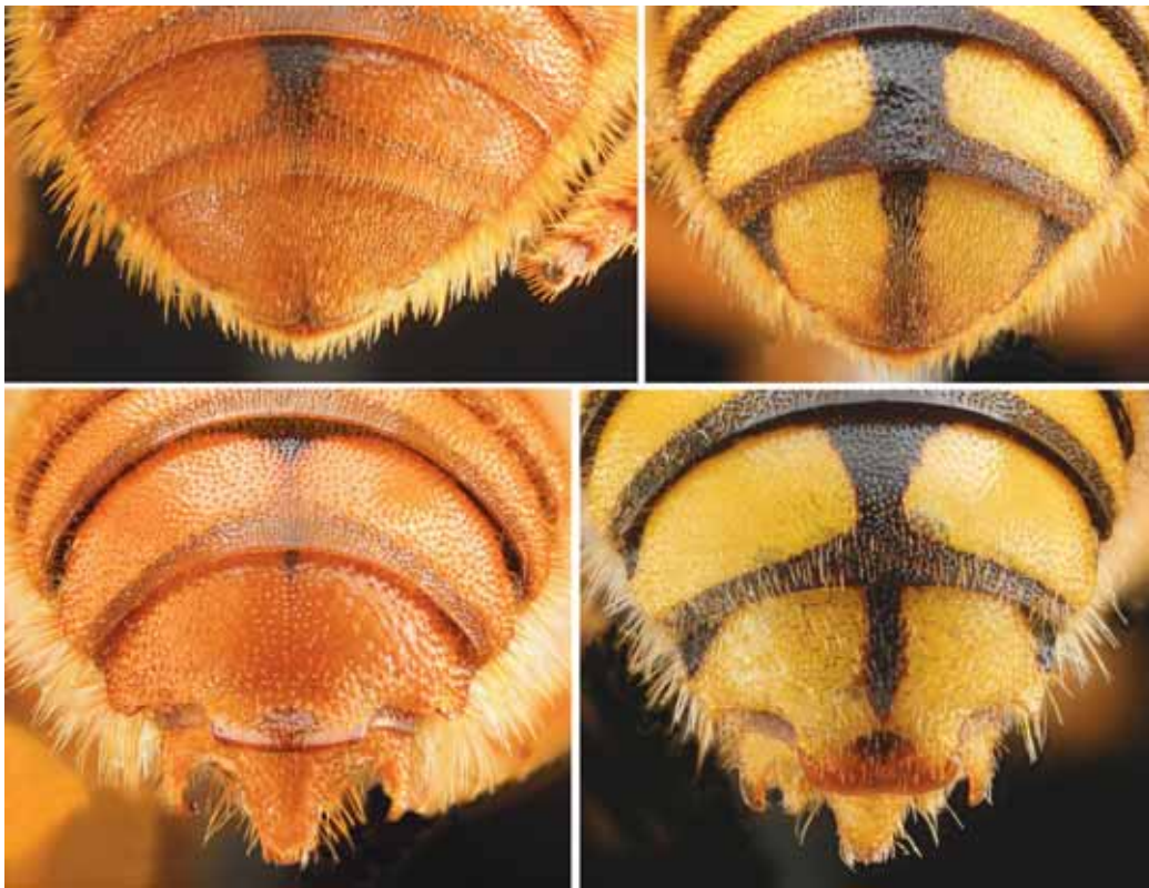
Figure 2. Apical terna. Upper row: females (left: Rhodanthidium sticticum , right: R. ordonezi ). Lower row: males (left: Rhodanthidium sticticum , right: R. ordonezi ). – All material from Morocco in SMF, OLL, and cMS.